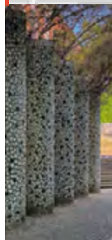
SITE 4: The Sp