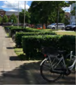
SITE 8: Kolding Harbour