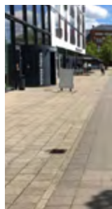
SITE 5: The P